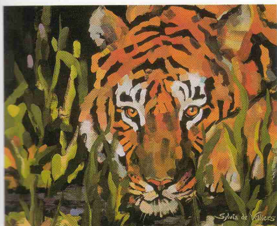
'JUNGLE MOODS' - 24" X 30" - 199 LIMITED EDITION SERIGRAPH ON CANVAS